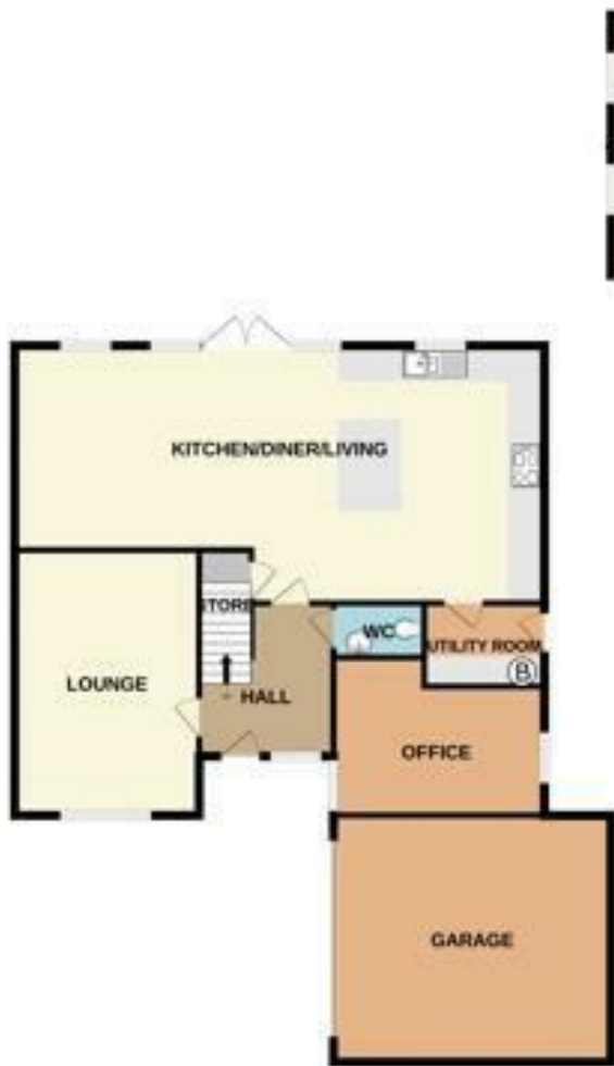
GROUND FLOOR 1476 sq ft. (137.2 sq m.) approx.